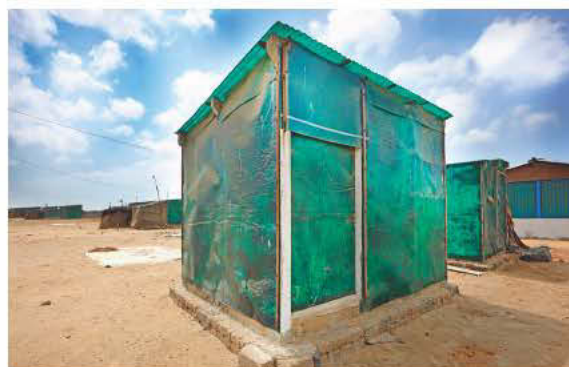
Temporary Shelter for Fisherfolk Community of Mundra

The primary school educating close to 125 students of standard 1st to 7th was built on a new location as resolved by the Gram Panchayat. Compound wall and water tanks were also constructed.